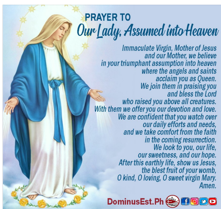
Holy Mary, Queen of heaven, as children of St Mary's, guide us in our daily work and play, with your gentle love. Amen